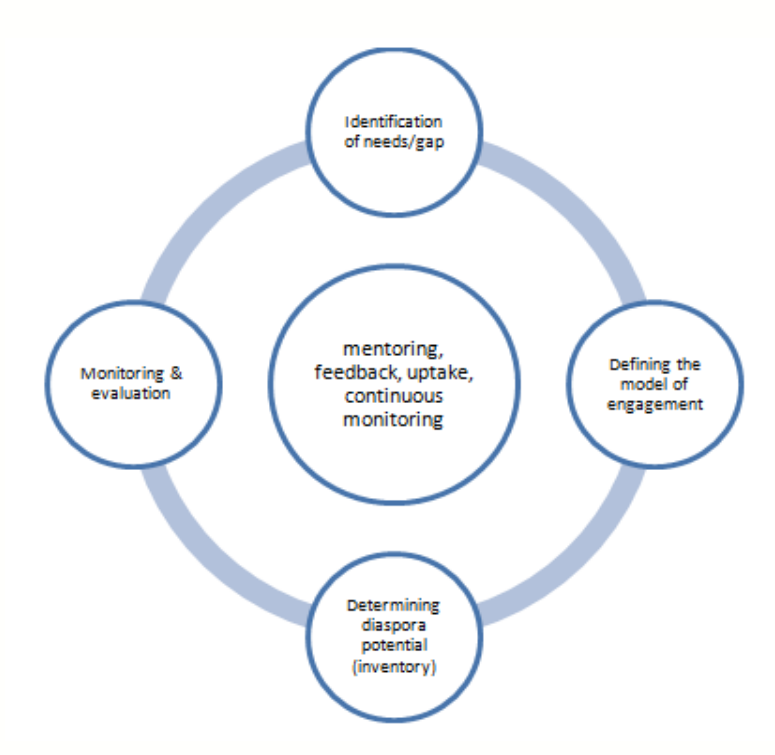
Figure 2 The implementation cycle pertaining to engaging diaspora to support specialty training in Sudan